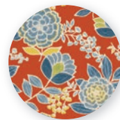
THIBAUT Sulu, Coral