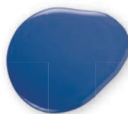
REDFORD HOUSE Blueberry

The designer's instructions: Make this cabin's guest bedroom joyful. Vibrant patterns, playful colors, and unique details do exactly that. The bold pattern of the wallpaper—repeated in the fabric of the window panels and accent pillows—sky-colored ceiling, and graphic chair underline the room's happy personality. The curves and delicate details of the spindled chair, scalloped dressers, and clover-shaped ottoman soften the design. Amidst calming white, bright orange accents add the finishing touch.