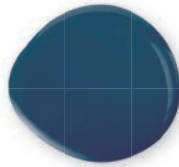
BENJAMIN MOORE Galapagos Turquoise