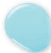
BENJAMIN MOORE Pool Blue